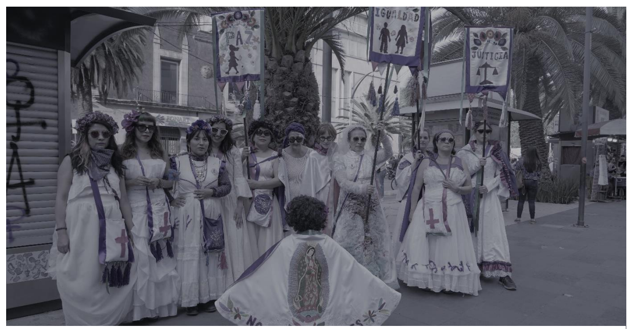
Activists protesting on Women's Day in Mexico

Gun violence takes toll on the lives of LGBTQ+ as well. If we compare with what kind of weapon people were killed in hate crimes, according to their identity, we will see that while 56.6% of trans people were killed with firearms, only 23.4% of homosexual people were killed in the same way (most of the people that Letra S records here as trans people are trans women, there is only one record at the base of a murdered trans man).<sup>29</sup> The case of trans people is an example of how armed violence can affect certain profiles within the community in a different way. Widespread violence puts us all in a more vulnerable situation, however, it puts the most vulnerable members of this community, who work on the streets and at night, in an even more dangerous situation.