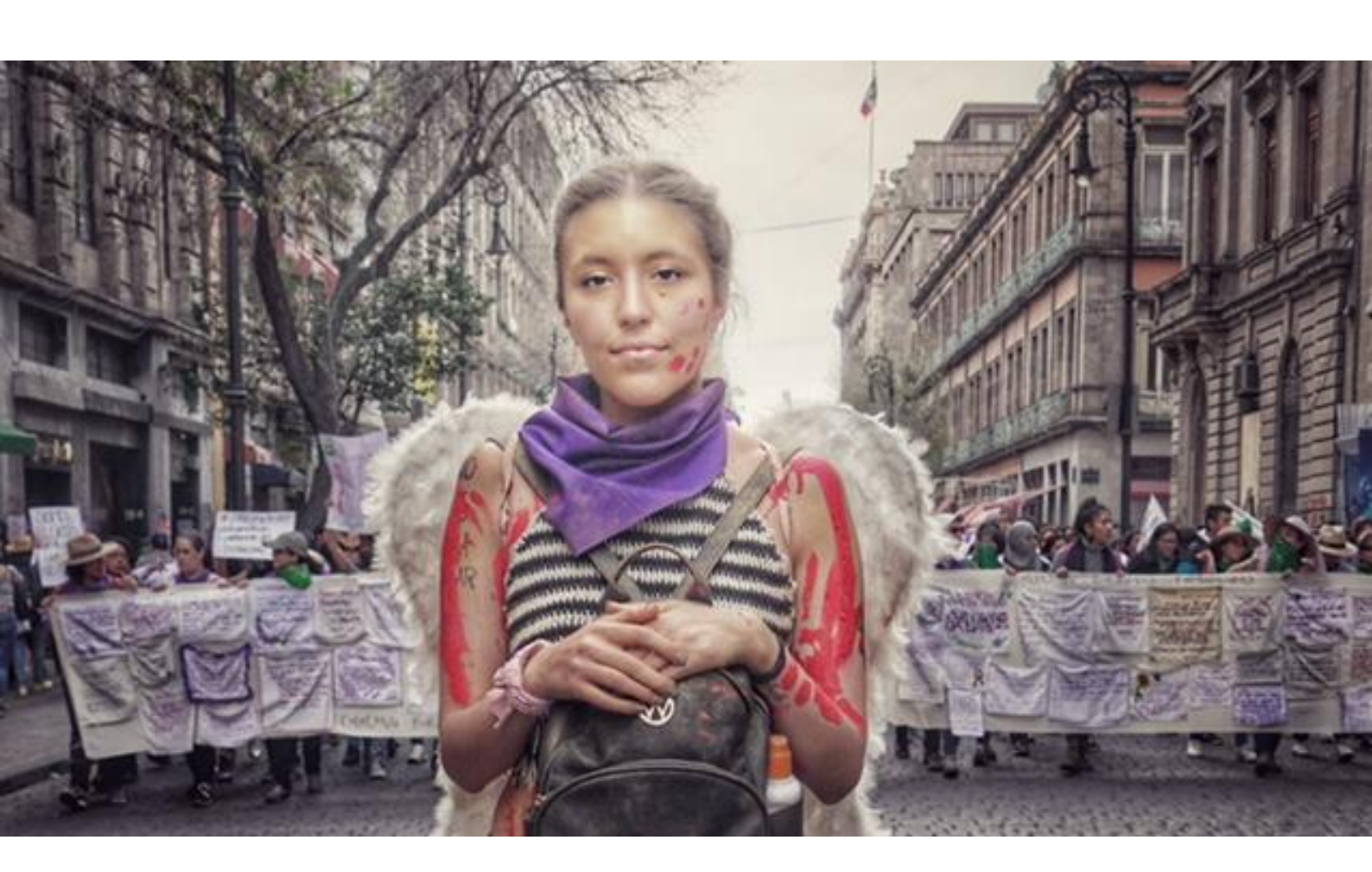
A paper by IM Swedish Development Partner