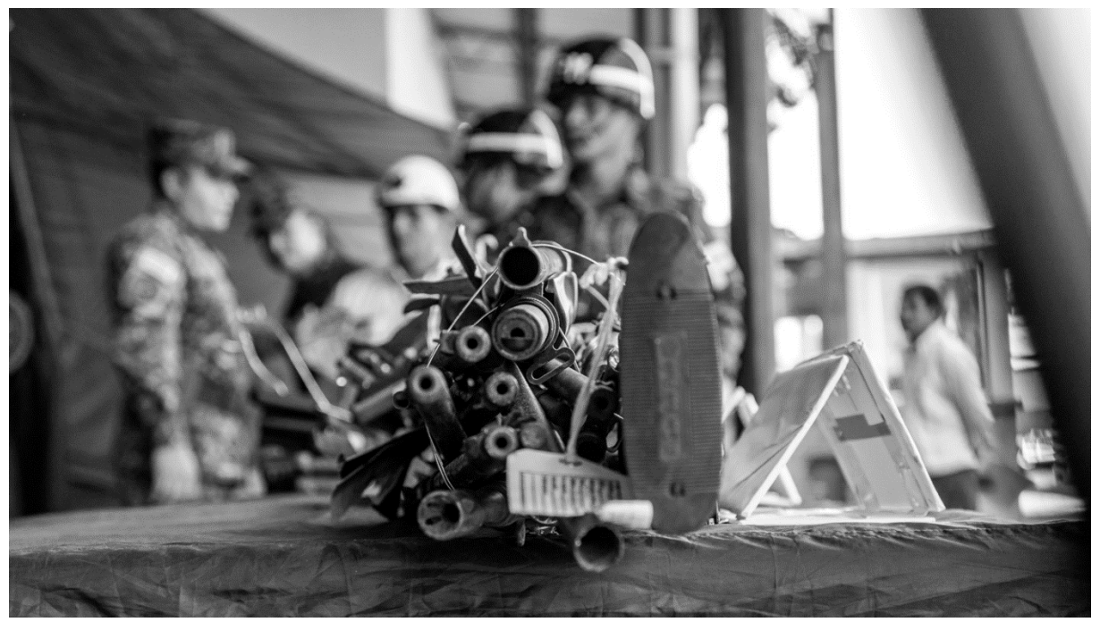
Weapons are secured for destruction in El Salvador

I was part of a self-help group, and in these groups, women can talk about everything and some dare to tell their experiences of violence. Actually, the idea with these groups is to work with crafts, make earrings, piñatas, bracelets, and to find a way out of poverty. This is not really a way out of poverty, but allows women to get together, that is the strength of these groups. A woman can leave her house for a moment and say to their husband that she will learn how to make a blouse or to embroider. And he will let her go. In fact, she goes to the self-help group to listen to the testimonies of other women. In one of these meetings, a young woman told us, that one day her husband was very angry with her, took the gun, went to the patio and killed the dog, he shot him twice. All the women in the group got scared and upset, and we told her to prepare her suitcase, that she had to leave the house, because this was a strong indication, a terrible sign. She listened to us, and the next day she left the house, she took her girl and left. Today she lives and works abroad, she writes to me from time to time, she is living a quiet life. She is very thankful to us, and writes that, now when she knows more, she understands that, if it was not for the self-help group, she would not have left the house and her husband.